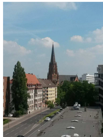
View from the classroom