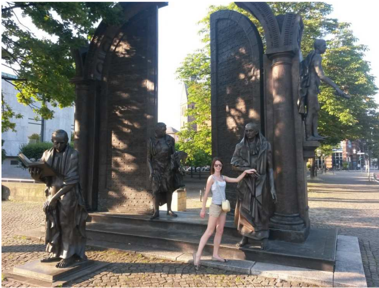
The city center of Hannover

Then when you are fed up with noisy clubs you can observe the city: it is quiet, picturesque and lovely. There a lot of great places to visit like Hannover City Hall, Royal Gardens of Herrenhausen, Erlebnis Zoo Hannover and so on. Just walking around the streets is like a small magic trip.