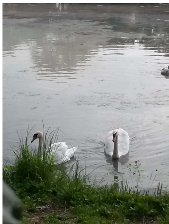
Swans near our dormitory

When we arrived, German student met us at the airport and transport us to the dormitory. So before my study begins I have time to observe the city and take part in Kick-Off Day which is very well organized. After Kick-Off Day we had a BBQ party.